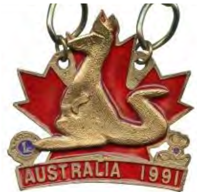
1991 Special Medallion