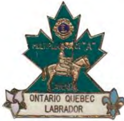
1977 V (Gold)