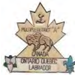
1983 Lioness V (Color)