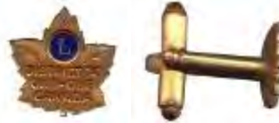
1963 Cuff Links