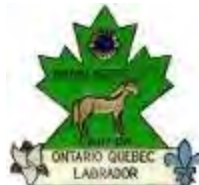
1987 Ultra Mini V ((Ontario Quebec Labrador on the base