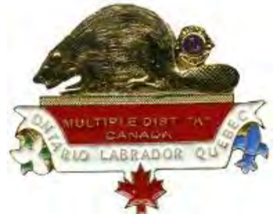
1991 P Made by "Pin Connection"

NOTE: The pins made by Emblematic are thicker than the ones made by the Pin Works. Also, the Lioness logo is significantly different.