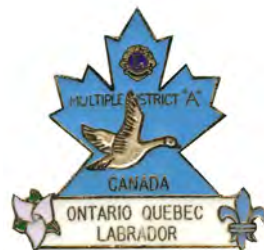
1981 Mini V 1 Small Emblem