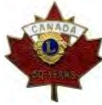
Windsor Downtown Lions Club 50th Anniversary