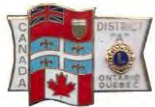
1972 V (Color)