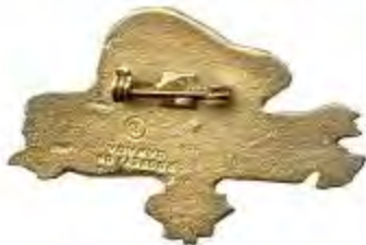
Reverse of Regular and Lioness pins made by Emblematic