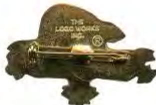
Reverse of regular and Lioness pins made by Logo Works