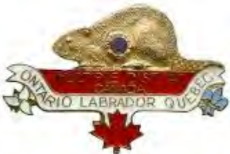
1991 Made by "Emblematic"

NOTE: These are two different reverses of the 1991 MDA mini pin. Emblematic was the maker of this pin and they used several different die marks.