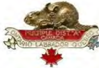
1991 Lioness Made by "Emblematic"