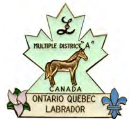
1987 Lioness V Horse Facing Right & Wording on Base