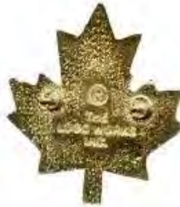
1995 Special Reverse Variations