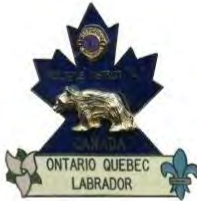
1984 V (Silver)