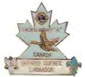
1981 V 2