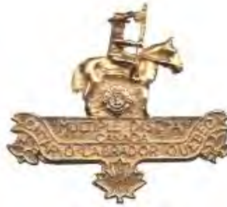
1992 V (Unpainted)