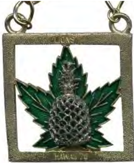
1976 Origin Unknown